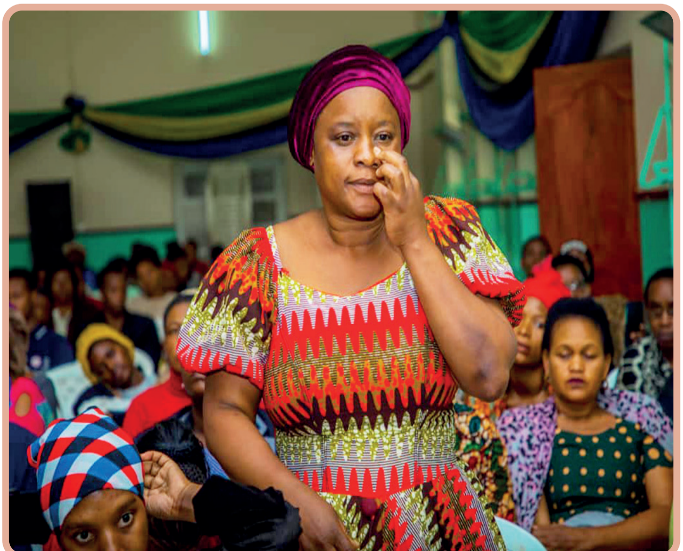
A woman having impaired hearing contributes during the training to special group in Arusha