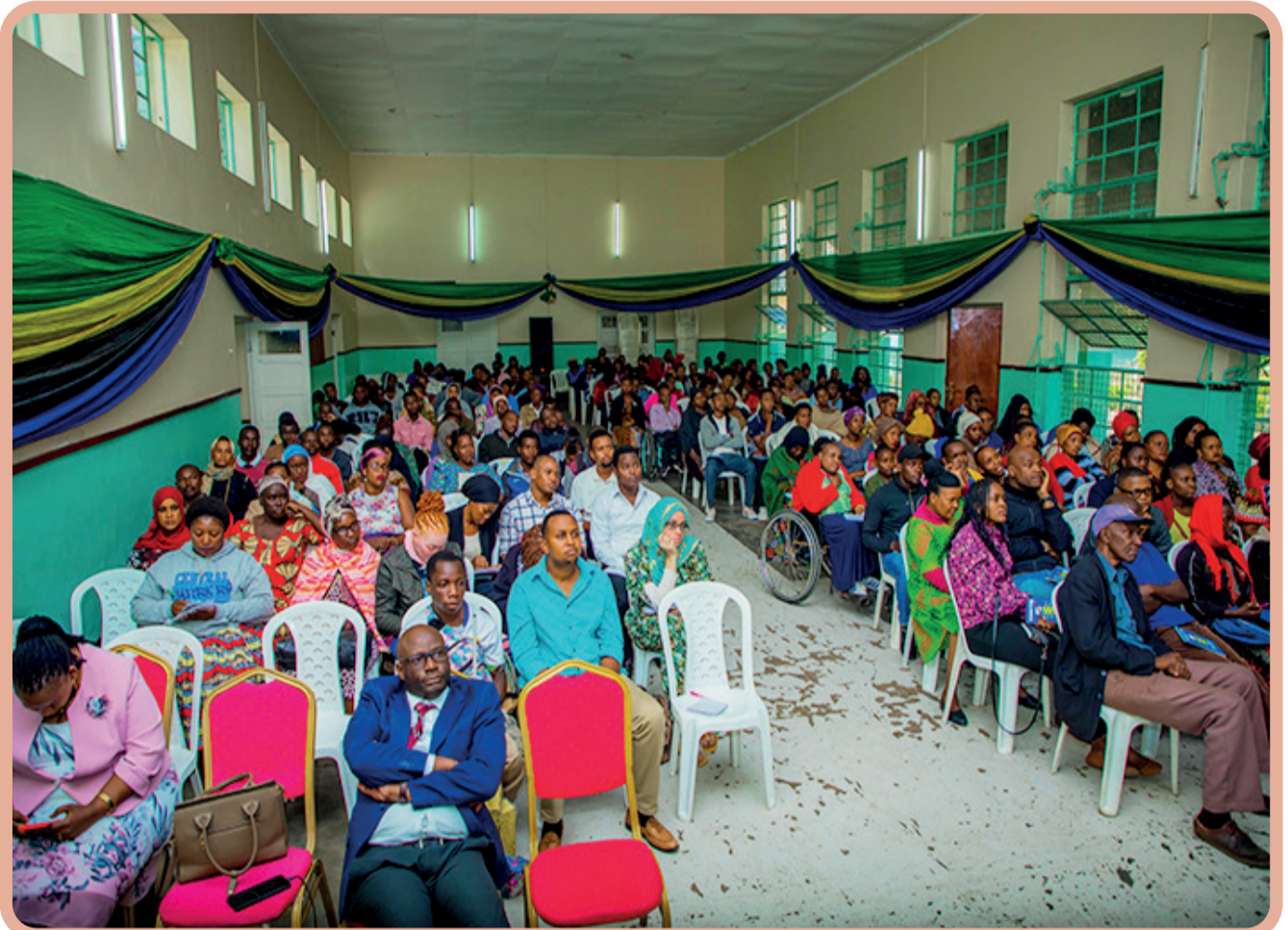
Participants from special groups attend training on procurement opportunities in Arusha, on May 7, 2022

The Editorial Board reserves the right to approve or disapprove articles for publication in TPJ.